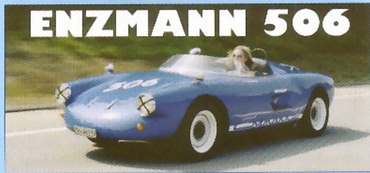
ABOVE: The real Enzmann 506. Below left: 1:24 Renncenter model with 1:43 Swissmini. Below right: Emmy 1:43 model (blue) and below that another shot of the red Swissmini model.