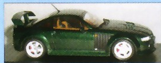
NOREV 1:43 diecast in China for France: MG SVR, left.