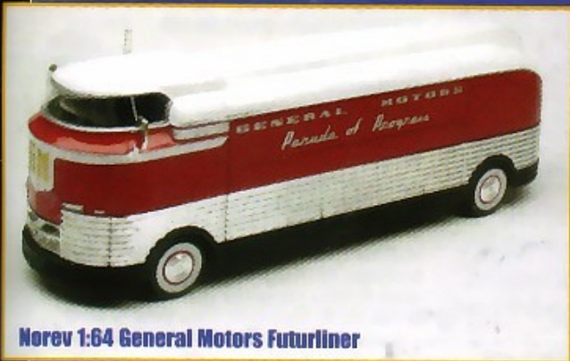
Norev 1:64 General Motors Futurliner