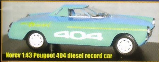
Norev 1:43 Peugeot 404 diesel record car

Bentley, Hillman, Morris, Skoda, Rolls-Royce, Aston Martin, Ford... and more