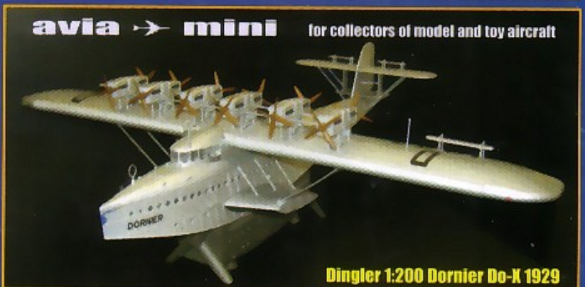
Dingler 1:200 Dornier Do-K 1929