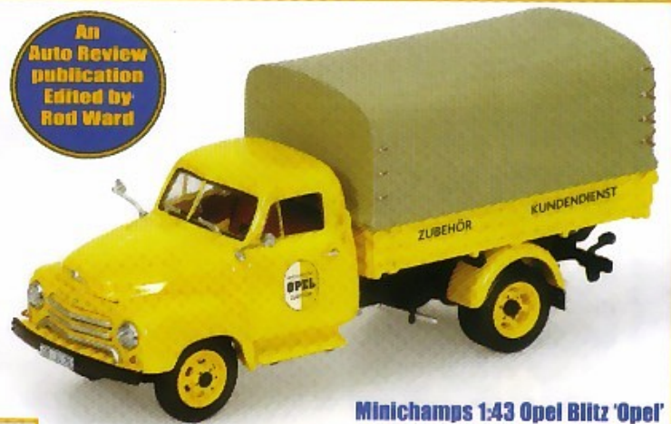
Minichamps 1:43 Opel Blitz 'Opel'

An Auto Review publication Edited by Rod Ward