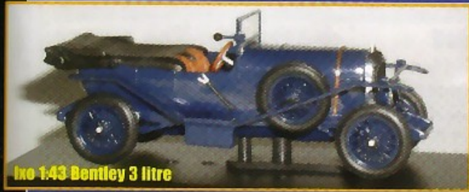
Ixo 1:43 Bentley 3 litre