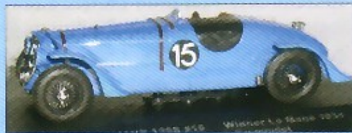
IXO 1:43 diecast in China: Delahaye 135S Le Mans 1938 #15 winner, above right.