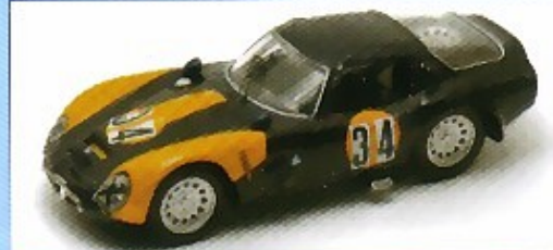
BEST 1:43 diecast from Italy: 9329 Alfa TZ2 Misano 1973.