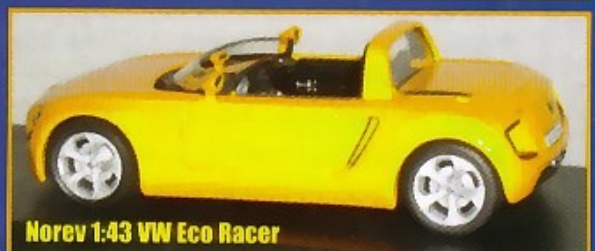
Norev 1:43 VW Eco Racer

Bentley, Hillman, Morris, Skoda, Rolls-Royce, Aston Martin, Ford... and more